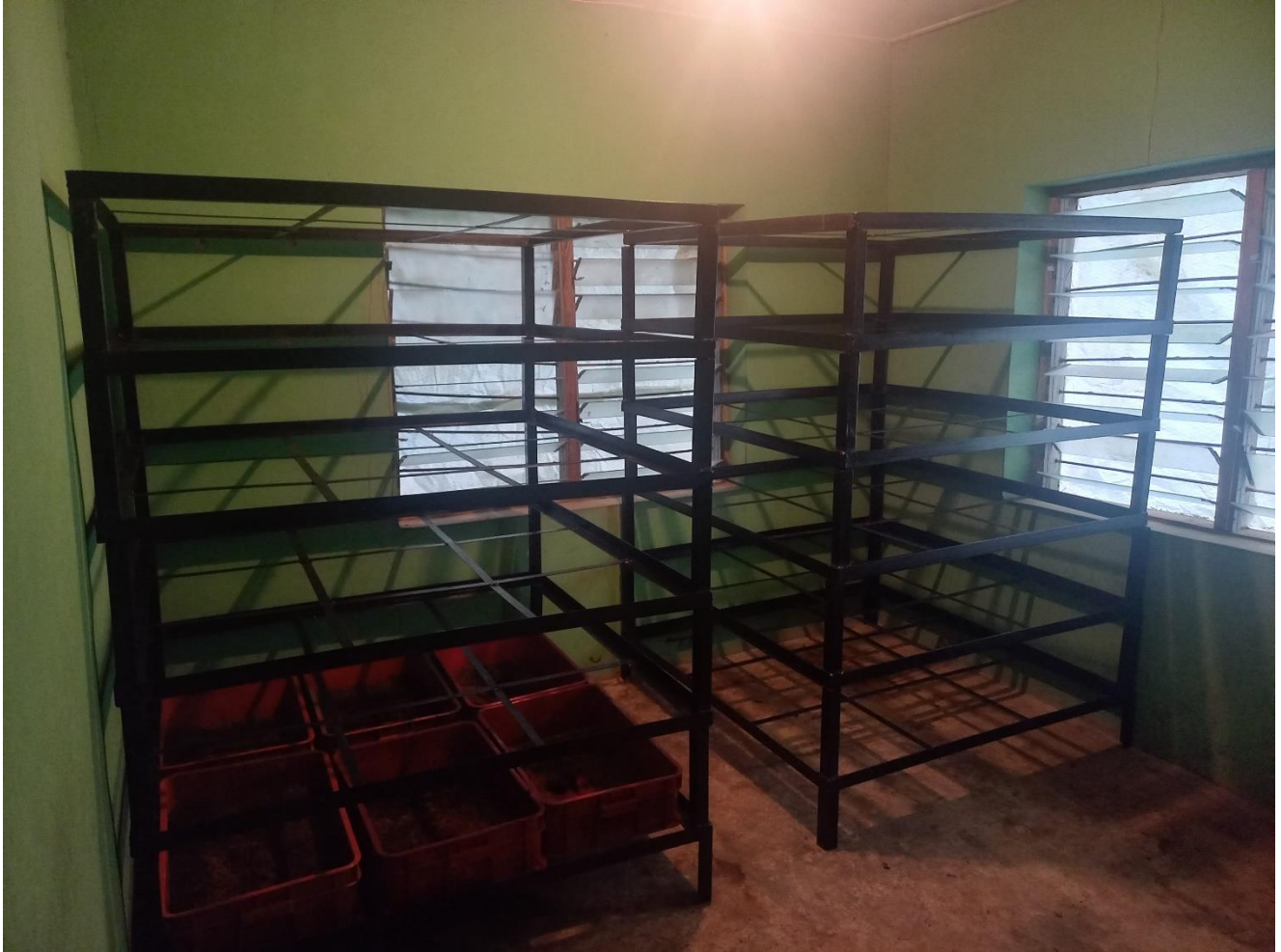
Figure 1 Our waste treatment Unit in entojutu Nigeria

We announced in our second newsletter that we would be starting our Farm works with flies project in Nigeria. W E HAVE STARTED PUTTING TO GETHER OUR FACILITY IN Akinyele to see that we are ready for our training in the next quarter.