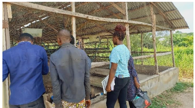
Figure 2 Monitoring and Adoption Visit of Farm works with Flies Farmers