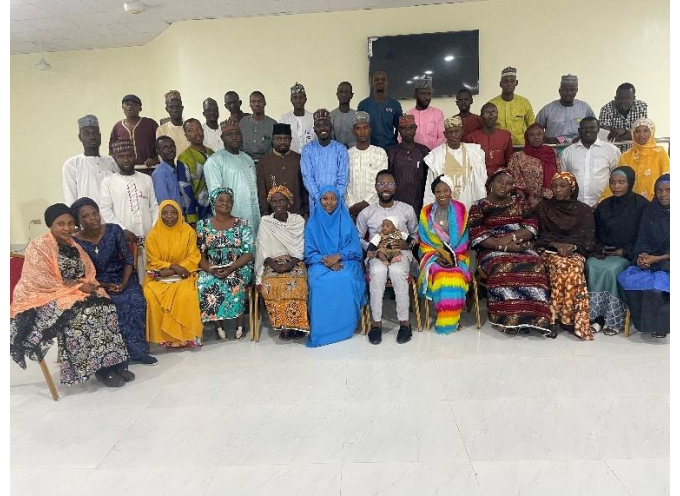
Figure 3 Gombe- North East Nigeria Farmers training