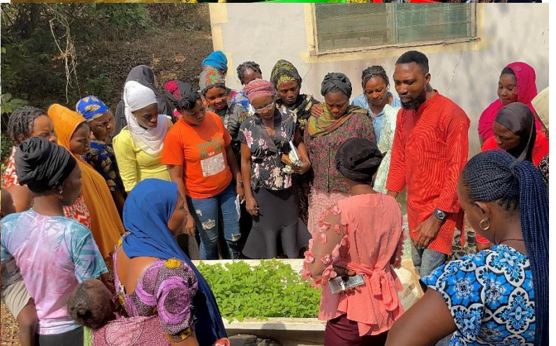
Figure 1 Empowered by flies training