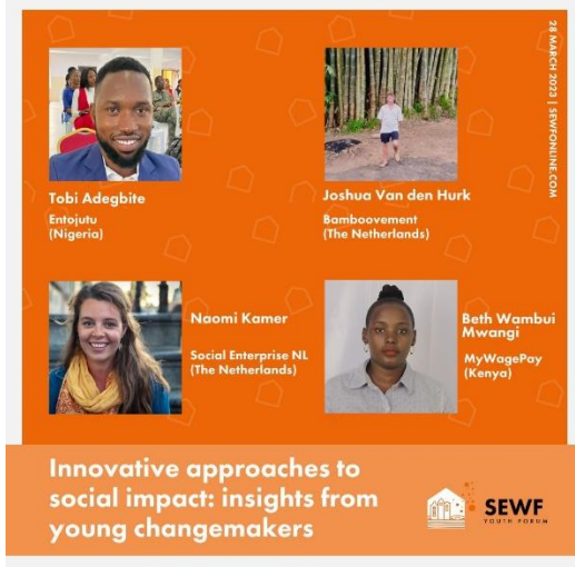
Figure 4 Social Enterprise World Forum Event