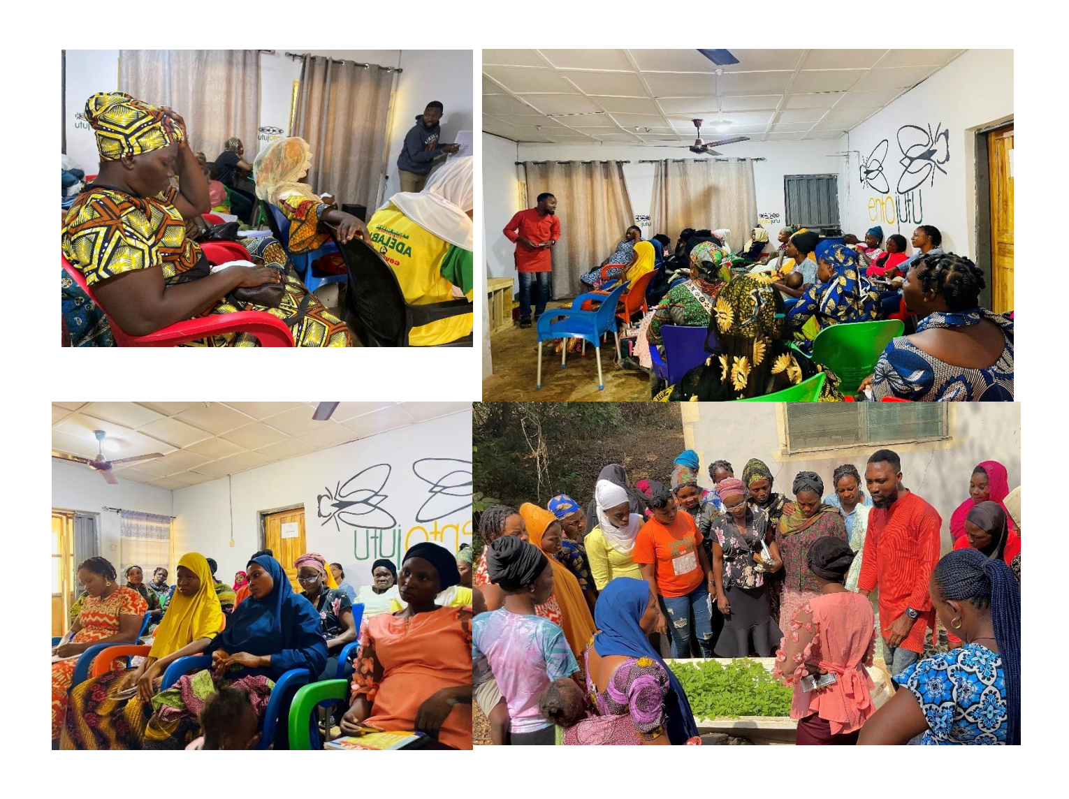
Figure 1 Empowered by flies training